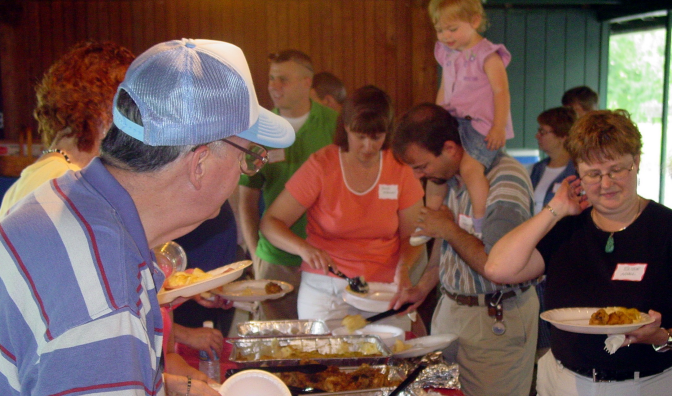
Hottenstein Reunion Picnic, at the Watsontown (PA) Municipal Park